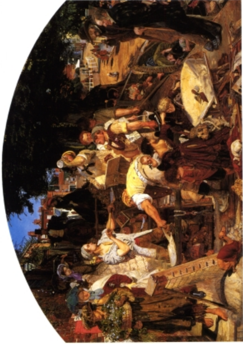
fig. 1. Ford Madox Brown, Work (182-65)