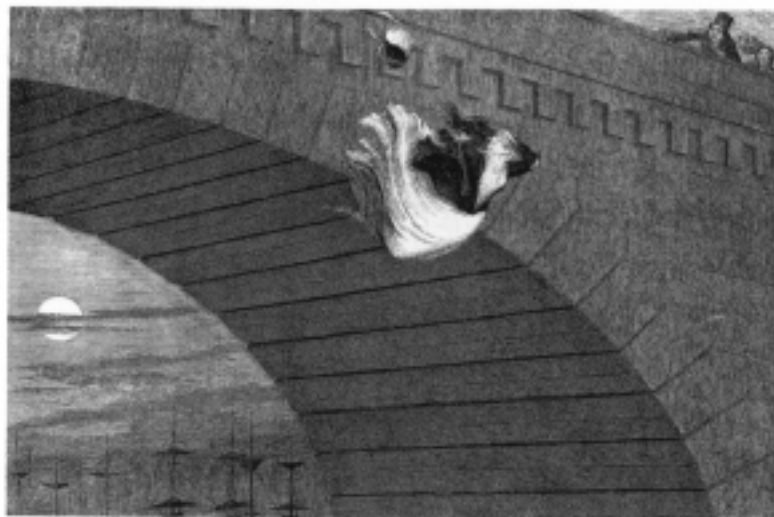
fig. 5 Cruickshank, The Drunkard's Children , plate 8 (1848)