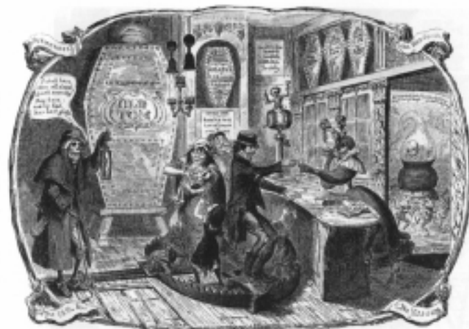
The GIN Shop.

... how the man has shrouded his thoughts They needed the GIN from other parts!